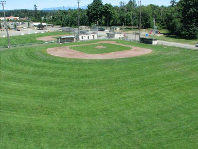
Nunn's Creek Ball Fields