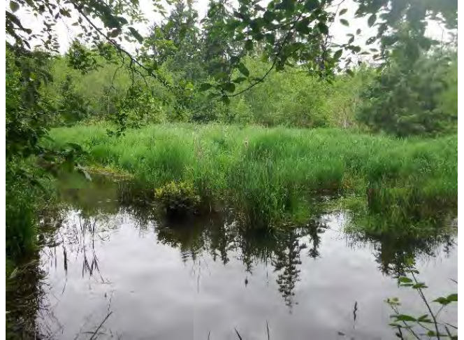
Nunn's Creek wetland areas

Nunn's Creek is a complex park that features active functions alongside both disturbed and intact natural areas within the City's boundaries. This park is home to Campbell River's minor baseball teams and major events including the Salmon Festival and the Dog Fanciers' Society Championship Shows. The active areas of the park host thousands of visitors each year. The park's forest lands, owned by the Nature Trust and leased to the City, protect Nunn's Creek and provide important habitat for a wide array of birds, plants, and wildlife. Safety, security, and vandalism have been identified as key issues within the park.