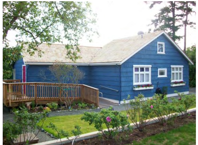
Sybil Andrews Cottage