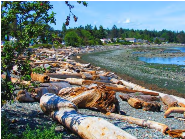
Frank James Park Shoreline