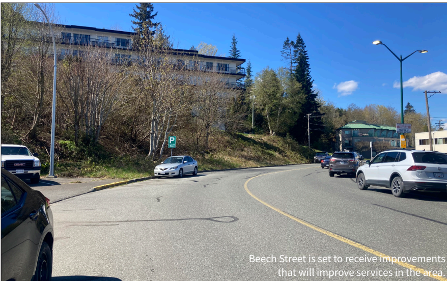
Beech Street is set to receive improvements that will improve services in the area.

THE LATEST NEWS ON THE BEECH STREET RENEWAL PROJECT: Welcome to the second community bulletin for the Beech Street Renewal Project, provided by the City of Campbell River. Questions/Comments? We invite you to contact us regarding any queries or feedback you may have.