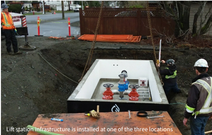
Lift station infrastructure is installed at one of the three locations