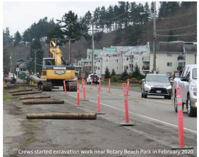
Crews started excavation work near Rotary Beach Park in February 2020

Work will continue until the end of the year. Follow along with these newsletter updates and online (Facebook/Twitter or www.campbellriver.ca/construction ) for more information