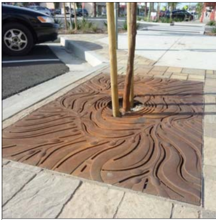
Tree grates will include kelp imagery.

The tree, shrub and plant species planned for the area are being selected based on their hardiness, suitability for the local climate, and how they will work together to create attractive landscaped areas.