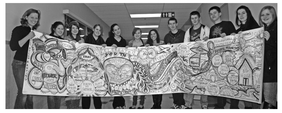
Campbell River Youth Action Committee seeking additional members

Thanks also the Campbell River Chamber of Commerce for the annual Business Awards of Distinction event.