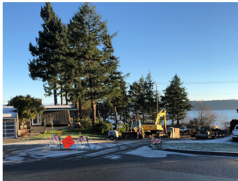
Construction at the 1st Ave. intersection

As well, thanks to the teams at Stantec Consulting, Highland Engineering and J. Cote & Son Excavating Ltd who were able to see this project completed on budget and on schedule.