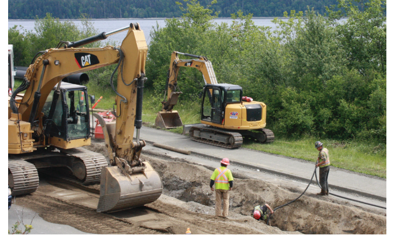
Crews work to install sewer forcemain near the connection point at 1st Ave.

The project team is now getting started on work between Simms Creek/Rockland Road and the Big Rock Boat Ramp for significant construction that will result in all new underground services (including undergrounding of overhead wires) as well as new roadway with centre turn lane, sidewalks, park spaces, parking lot