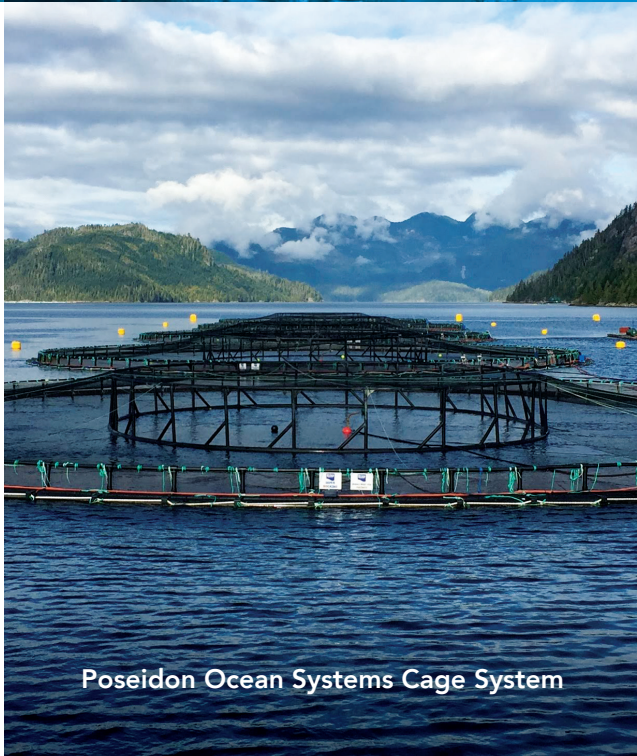
Poseidon Ocean Systems Cage System

Communication and collaborative projects with provincial and federal bodies, in support of local aquaculture, continue to be top priorities of our municipal government.