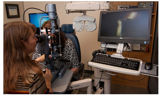
FYi Doctors