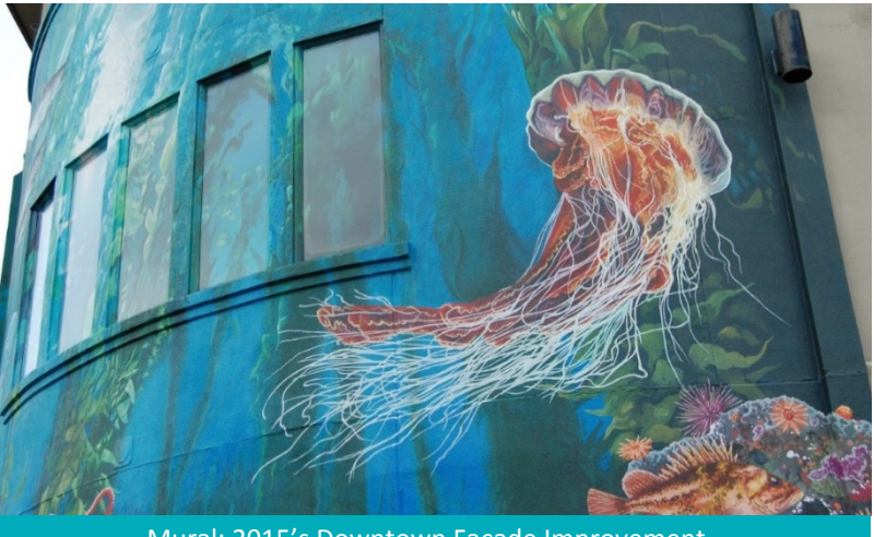
Mural: 2015's Downtown Façade Improvement

The City has initiated a downtown façade improvement program to help revitalize and attract more people and businesses to the downtown core by providing grants – to a $10,000 maximum – for property owners to refresh the look of buildings with storefront improvements.