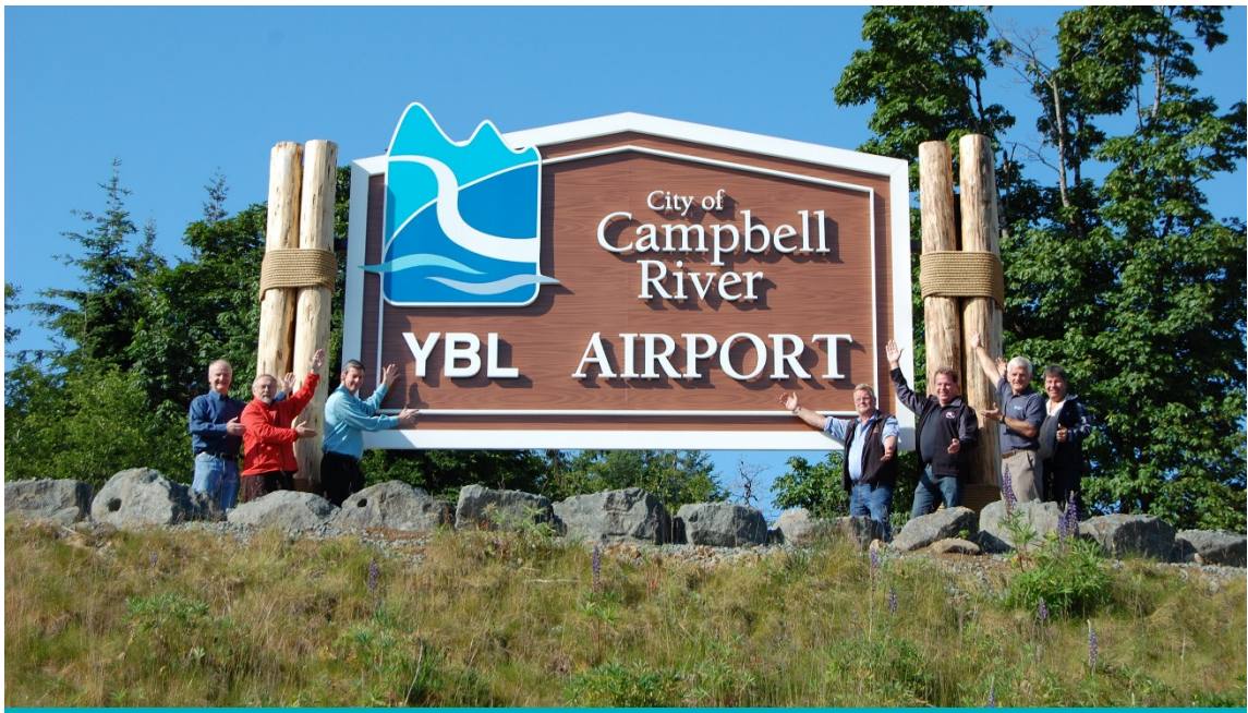
Come fly with us! On June 1, 2016 members of City Council and Airport Authority Commission posed for this photo to show off a new roadside attraction at the intersection of Jubilee Parkway and the Inland Island Highway.

The City of Campbell River currently has vacant lease lots at the Campbell River Airport. The lots are either zoned Airport One or Airport Two and vary in size. The Campbell River Airport is a full service, all weather airport with global commercial airline access. The airport is ideally situated to major Canadian and US markets. YBL is also situated among one of North America's top leisure tourism destinations with many commercial, corporate and general aviation business opportunities to support, grow and compliment this sector.